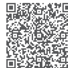
Registration & Abstract Submission