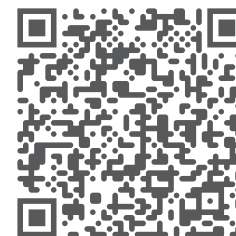
Abstract Template Download

Download the abstract template from the first QR code below. Submit the abstract along with the fee payment receipt through the link provided in the second QR code; this will serve as confirmation of registration and eligibility for presentation.