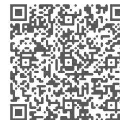
Registration & Abstract Submission